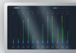
The AquaTouch7 Remote is the perfect compliment to AquaControl products